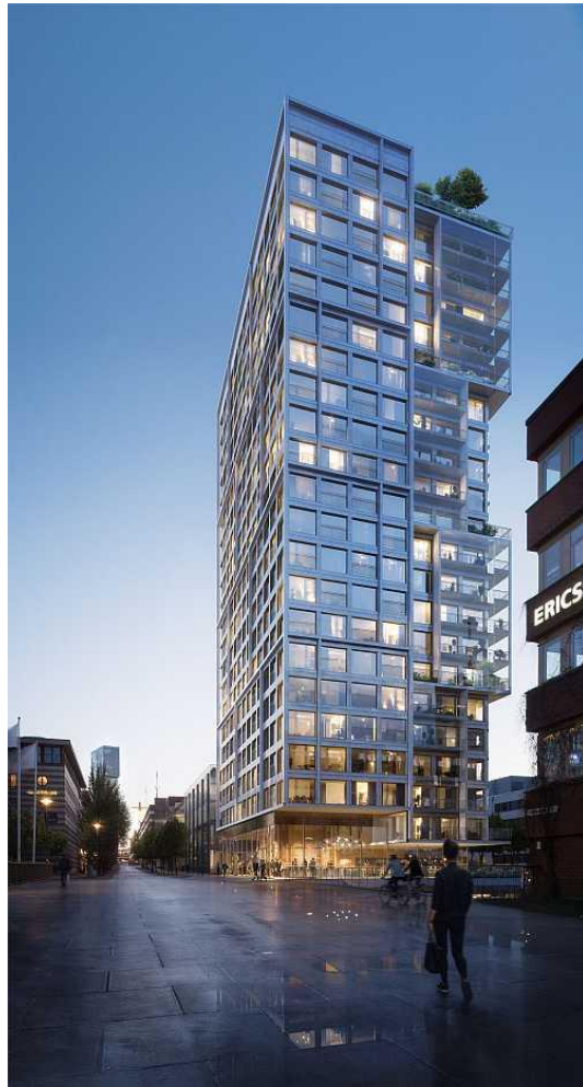
C F Moller – Stockholm